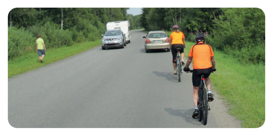
The photograph shows cyclists riding on the right side of the carriageway, in single file and keeping moderate distance

At the side of a carriageway, cyclists are required to drive in the same direction as the other vehicles. Cyclists should keep to as far right of the road as they can. If there are multiple cyclists, they should ride single file.