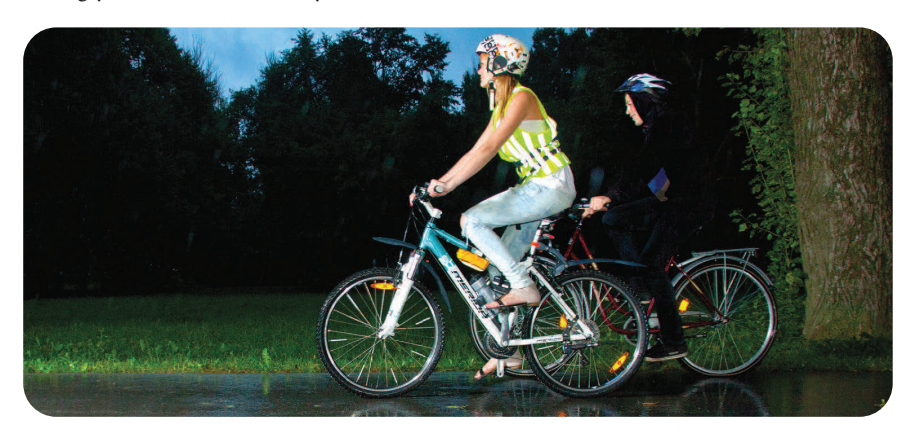
The photograph shows a comparison of a cyclist in a safety vest and a cyclist in dark clothing in the dark.

It is recommended that you make yourself clearly visible both during daylight and when it's dark outside. A cyclist can make themselves more visible by wearing brightly coloured clothes and a safety vest. It is not mandatory to wear a safety vest, but it is strongly recommended that you do so on unlit roads.