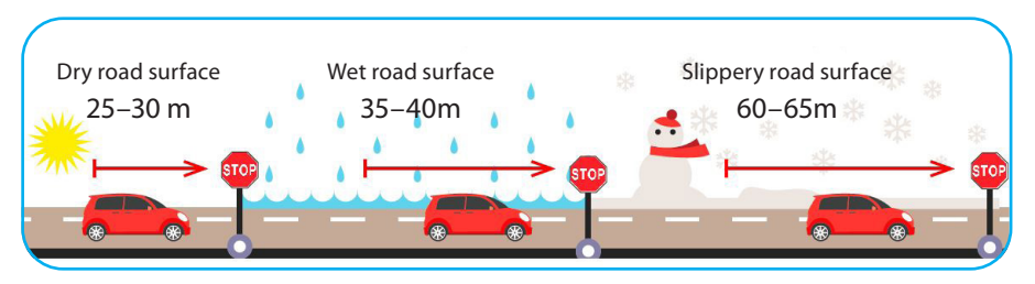
The stopping distance at 50 km/h (speed in a built-up area) depending on weather conditions.

Our winters are snowy and high snowdrifts can form at the side of roads and impair visibility. The sidewalk and carriageways are oftentimes slippery and cause the braking distance and therefore the stopping distance of vehicles to increase considerably.