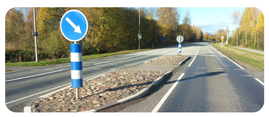
A photograph of a crossing.

At a crossing, cyclists and drivers of personal light electric vehicles or light mopeds can cross the carriageway without getting off of their vehicle, however, they do not have right of way towards drivers of vehicles, unless they use the crossing on a carriageway onto which the driver of the vehicle is turning. At a crossing, cyclists and drivers of personal light electric vehicles or light mopeds must move at the speed of a pedestrian and without endangering pedestrians.