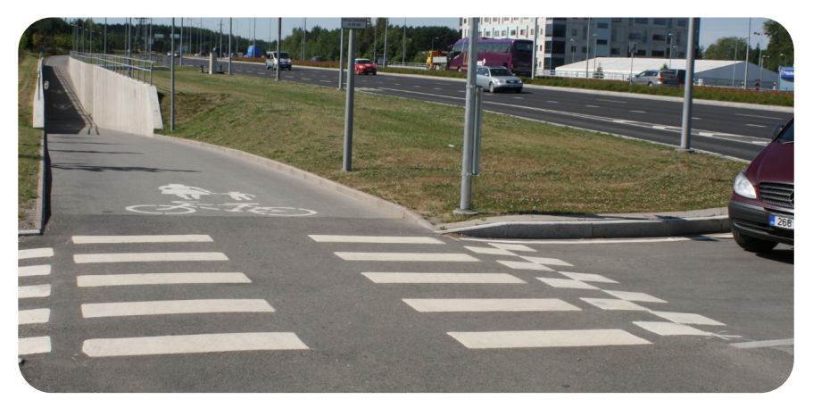
A cycle and pedestrian track with a threshold intersecting with a carriageway.

If the cyclist crosses a carriageway onto which the driver of a vehicle is turning then the driver must give way to the cyclist (unless the right of way is regulated differently with traffic control devices).