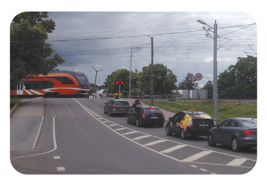
The photograph shows a regulated level crossing.

If there is a traffic light on the level crossing and it is flashing red then it is prohibited to cross the railway. It is recommended to cross the railway as perpendicularly as possible to ensure that the risk of falling is kept low.