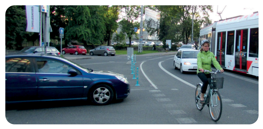
The photograph shows a cyclist riding in the cycle lane at the carriageway.

As the cycle lane is a part of the carriageway, cyclists riding in the cycle lane have to adhere to the same rules as drivers on the carriageway.